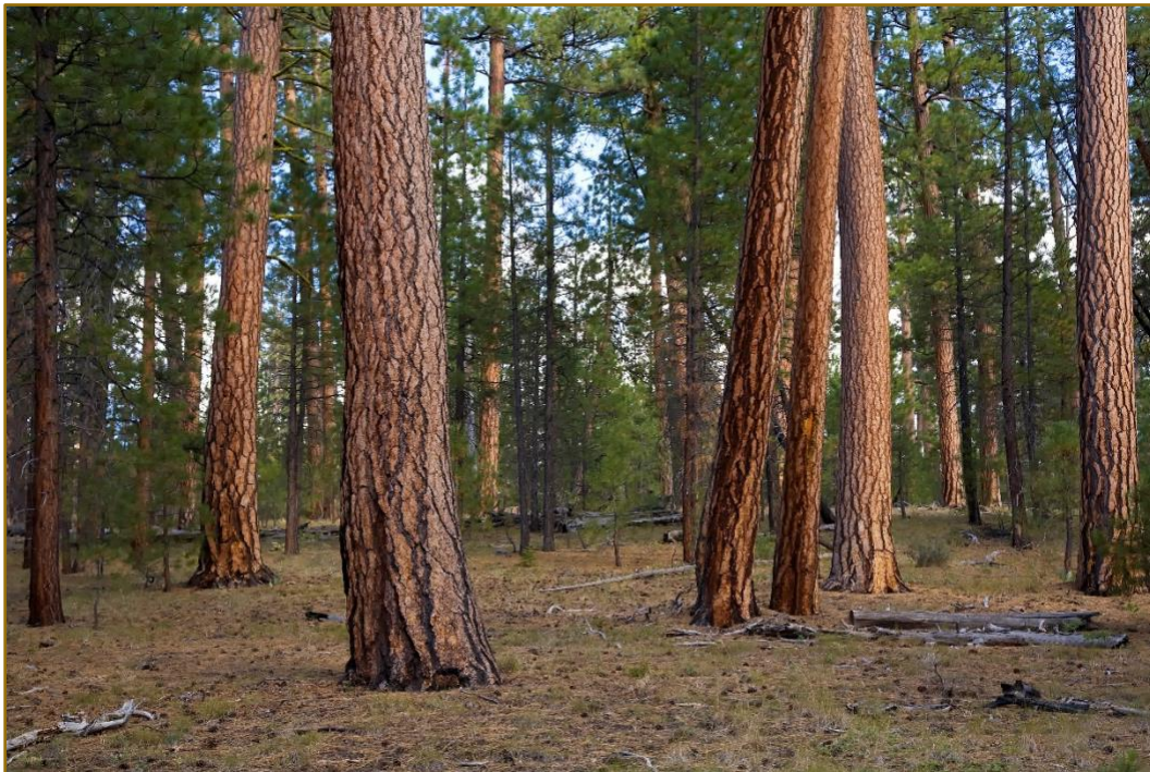
Old-growth ponderosa pine forest stand on the Fremont-Winema National Forest in Oregon.

Fulfillment of Executive Order 14072, Section 2(b)